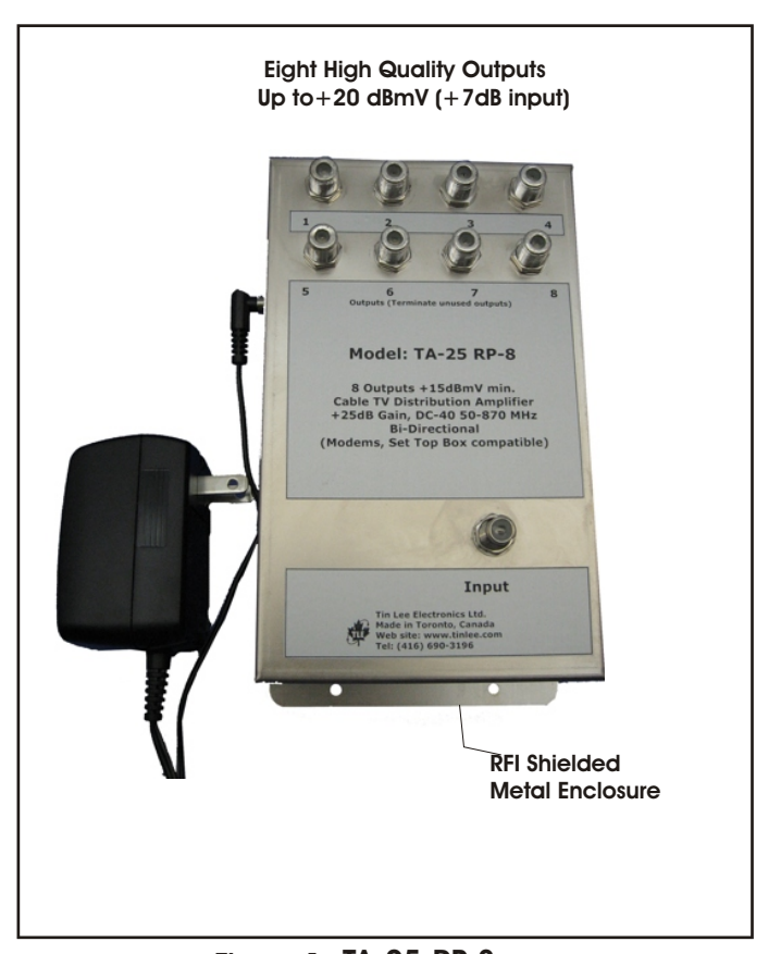
Figure 1: TA-25-RP-8

Full technical support and two-year warranty